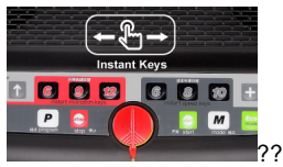
Speed & Incline Control Panel