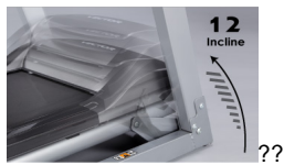
12 Levels of Incline